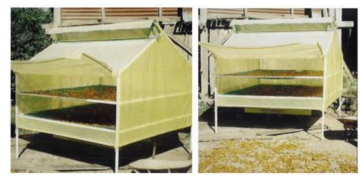
Figure 4: A typical solar drier developed in Bolivia