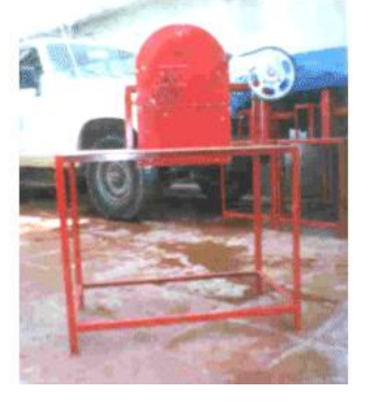
Figure 2: A simple slicing machine used in Bolivia.

The cooked fingers or bulbs are dried until they have a final moisture content of 5-10%. An experienced turmeric processor will know when the rhizome is dry enough as the fingers will snap cleanly with a metallic sound. Traditionally the rhizome pieces are laid on clean concrete floors and dried in the sun. This method can take anything from 10 to 15 days, depending on the climate and the size of the